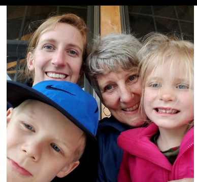
3 Generations of "Martin's/Spauldings" at Pine Springs Camp

SUNDAY BIBLE STUDY (will resume Sept 9) TUESDAY WOMEN'S BIBLE STUDY 10am = ongoing